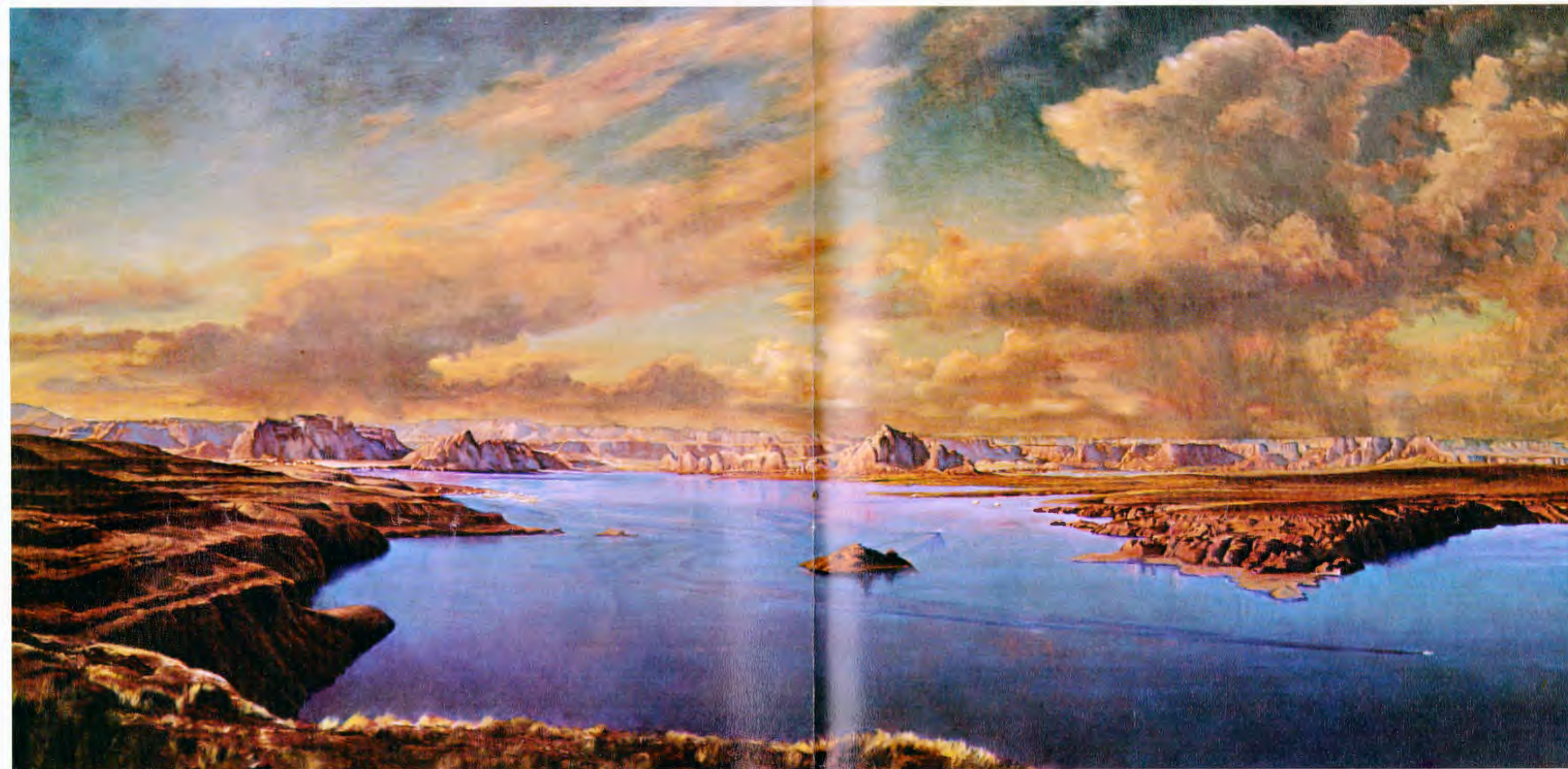
WAHWEAP (Painting size 48" x 96")

Before a century had passed after Powell's first exploration of the Colorado, the works of man had irrevocably altered this mighty river. The construction of Glen Canyon Dam has created the 186-mile-long Lake Powell, called by many "the most beautiful man-made body of water in the world." This painting depicts the majesty of Lake Powell in the magnificent desert setting as seen from Lakeshore Drive. The Ute Indian word "Wahweap" is translated as "white water."