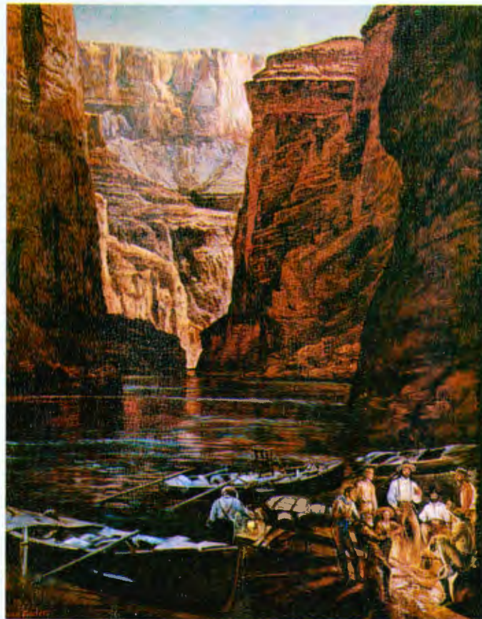
CAMP SITE (Painting size 36" x 48")

In the depths of Marble Canyon of the Colorado River, Major John Wesley Powell and his crewmen make camp along the river bank. Their heavy oak boats have been pulled up on the beach, and the men relax after a hard day of portaging their boats around the rock-filled rapids.